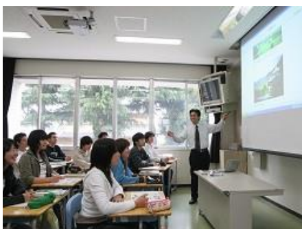
History classes using projectors

Based on such thinking, I am working on my research and lectures for students.