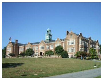
Towson University, where I stayed to conduct research on Jewish American Literature