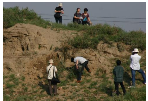
Survey of the castle ruins in China