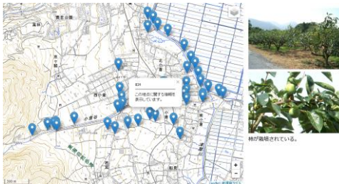
Web map for geography education using Leaflet and GSI tiles

I am studying about teaching methods of geography education, especially maps. Now in the Digital Age, we can use various digital maps. I am working on the educational web pages with the web map technologies such as Google Maps API, Leaflet, Cesium and GSI maps. I am working on making maps for education not only based on digital device but also based on paper materials. Information Technology brings us various attractive maps which improve geography education.