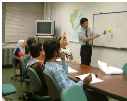
Lectures for international students from Asian countries