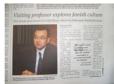
Towson University's college newspaper on my speech on Jewish and Japanese cultures