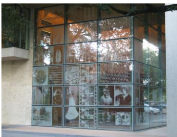
University of Texas, Austin, where they have a lot of literary materials relating to Jewish American Literature

When you read Jewish literature, you need to understand their culture and history, too. Therefore, I conduct research on them: how Jewish people live, how they reacted to the Holocaust in the last century, and so on.