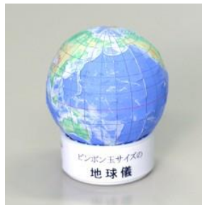
Small globe which is made of a ping-pong ball